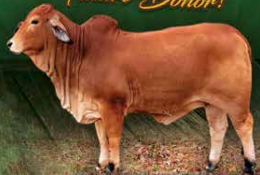
HOF MS VITA LOCA 05/1 (PP)

Sire: LMC LN Polled Pappo 136/6 (P) Dam: CT MS Butler Rhineaux 78/5 (P)