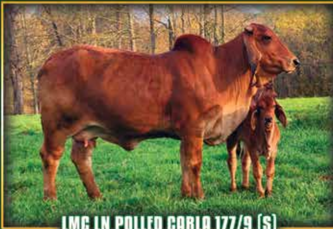
LMC LN POLLED CARLA 177/9 (S)

We strive to select donors that are functional, productive, polled and performance driven!