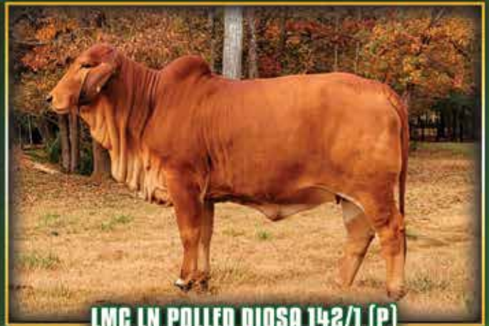
LMC LN POLLED DIOSA 142/1 (P)

Sire: Mr CT Rojeaux Rhineaux 1/12 • Dam: +Miss Triple C 5/4 (S)