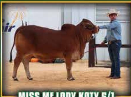
MISS MF LADY KATY 5/1

Sire: #Nioka Pablo[PP] (P) 800 • Dam: LMC LN Polled Crystal 166/7 (P)