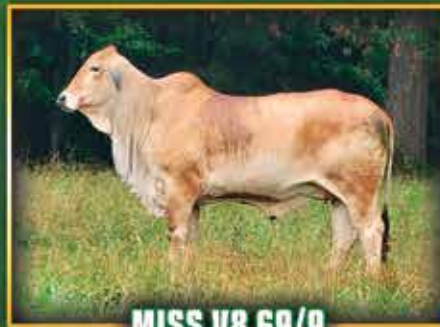
MISS V8 69/9

Sire: +Mr WCC Maximus Rojo 82/4 Dam: Miss Double A 3/150