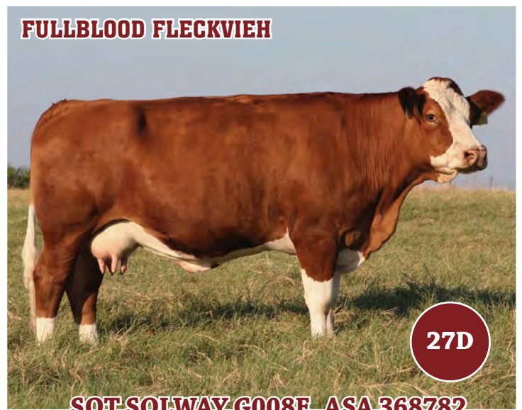
SOT SOLWAY G008E, ASA 368782

SIMMENTALS OF TEXAS is proud to offer, for your appraisal; the pick of four proven donors, for a IVF aspiration, to the sire of your choice, with several sire exclusions on specific donors. The major exclusion is STARWEST POL CARTEL, unless the purchaser has purchased a semen share in CARTEL either in the USA, CANADA, MEXICO, SOUTH AFRICA or BOSWANA.