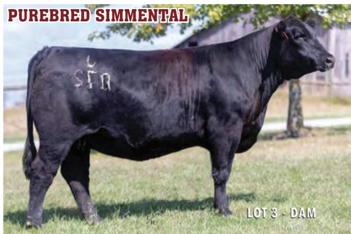
LOT 3 - DAM