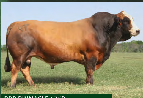
PRR PINNACLE 676D

Many of these Simbrah heifers are sired by PRR Pinnacle 676D, and they are bred to two of our calving ease sires, PRR Hickory 33K and 46H. We have built our program for more than four decades on meeting and exceeding industry needs and every mating is based on that mission.