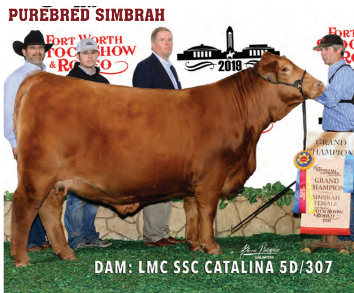
DAM: LMC SSC CATALINA 5D/307