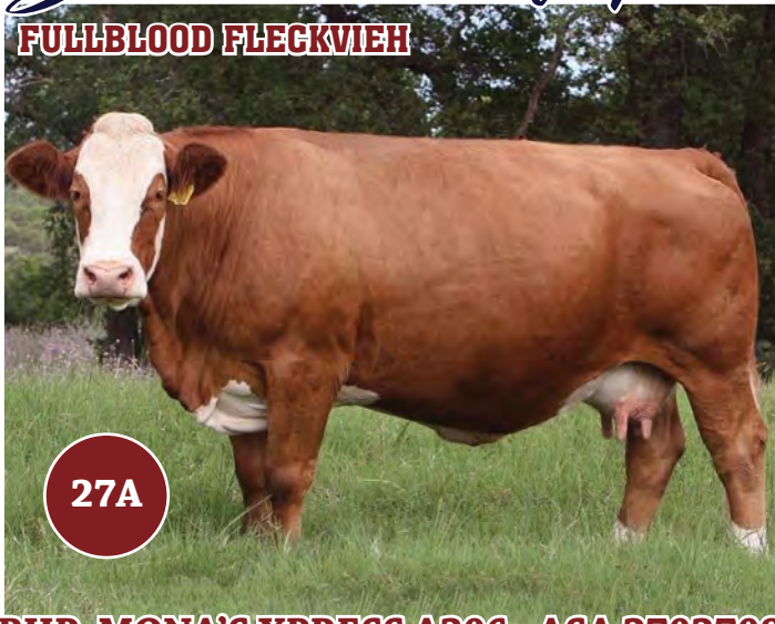
BHR MONA'S XPRESS A306, ASA 2702708