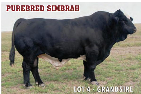
LOT 4 - GRANDSIRE