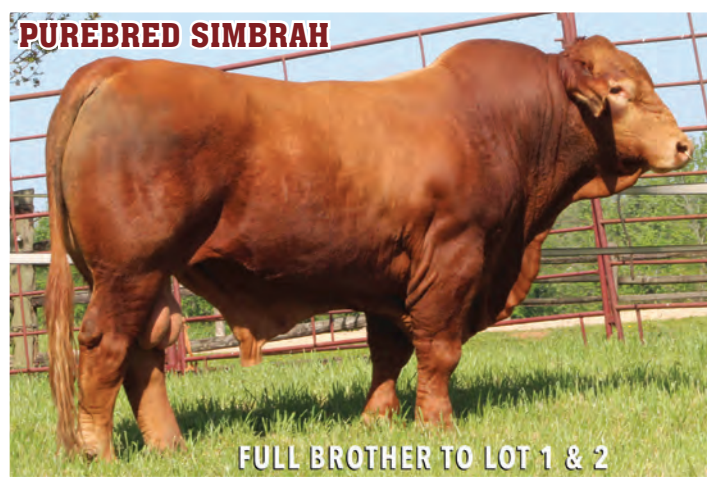
FULL BROTHER TO LOT 1 & 2