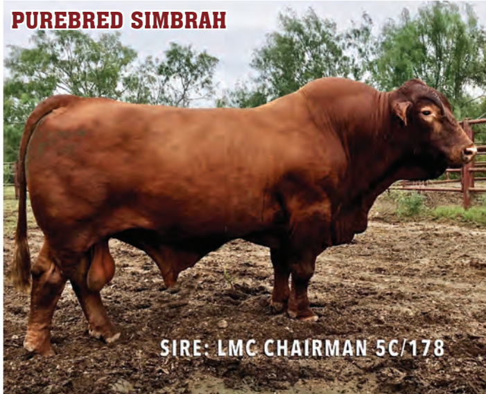
SIRE: LMC CHAIRMAN 5C/178