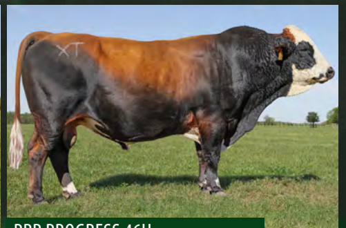
PRR PROGRESS 46H

FOR YOUR SIMBRAH NEEDS, COME TO PINE RIDGE.