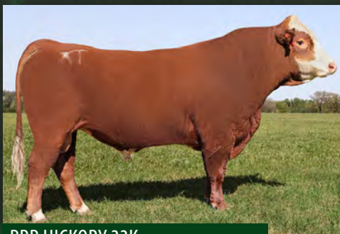
PRR HICKORY 33K